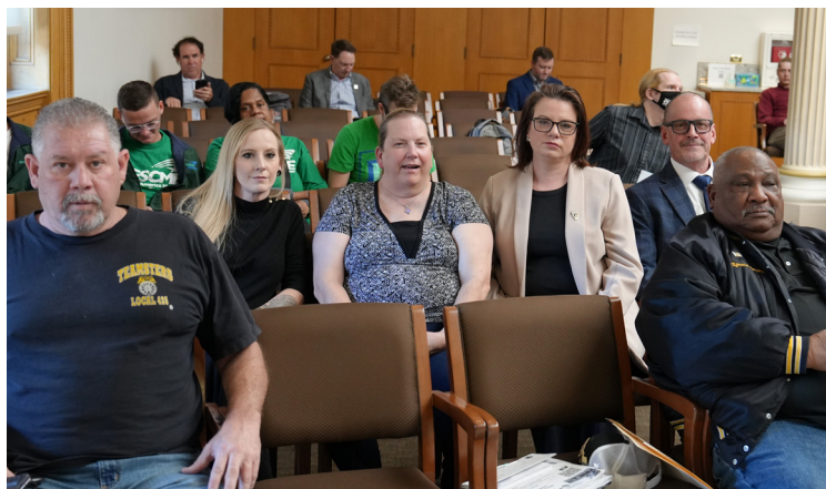
LOCAL 455 AND 17 MEMBERS IN THE BUSINESS AFFAIRS AND LABOR COMMITTEE SUPPORTING THE PASSAGE OF HB 26-1005