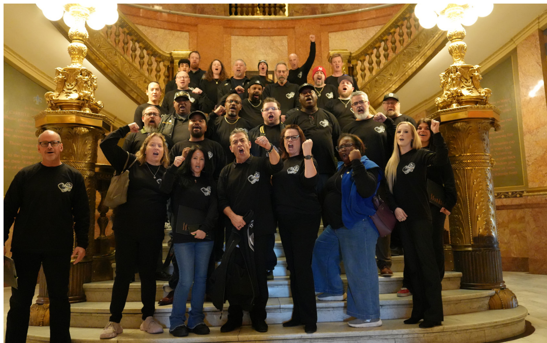
MEMBERS OF TEAMSTERS LOCAL 455 AND THE POLITICAL FIELD COMMITTEE SHOWED UP IN FORCE ON OPENING DAY, JANUARY 14, 2026

Hold your employer accountable and make sure your pay is exact. We